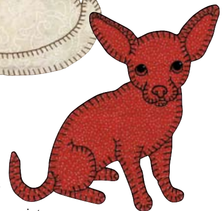
Darling Little Dogs

Please use quality 100% cotton fabrics, you will have better results. Choose a light or medium colored fabric that is not too busy for your animal if you are new to applique. It is easier to learn the techniques if you don't have to fight with the fabric quality, marked lines, or a too busy print.