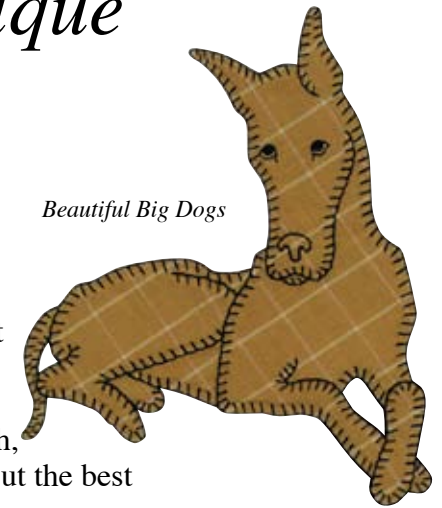
Beautiful Big Dogs