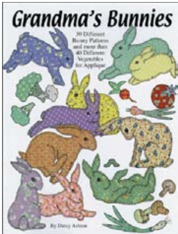
Grandma's Bunnies - $19.95